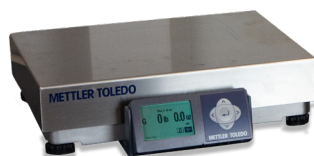
External Scale (optional)