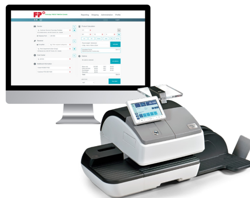
Vision S3 Shown