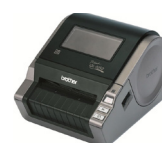
Label Printer (optional)